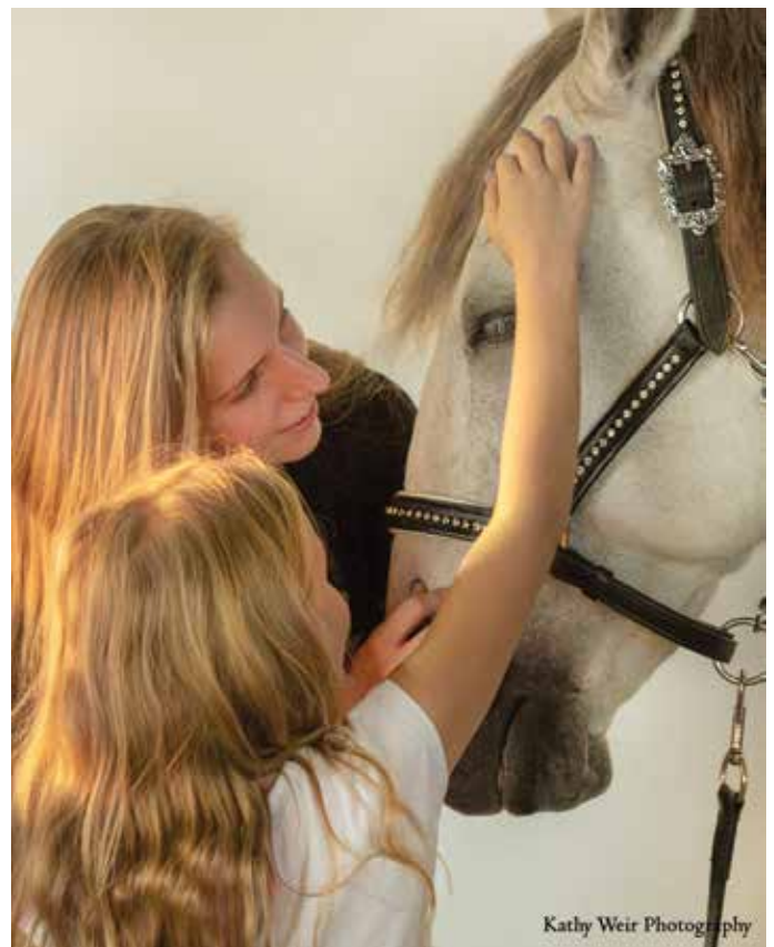
DIABLO BREYER MODEL

The Show Committee is very happy over the success of these new events. The goal was to be able to offer something, in addition to our USEF rail classes, that would appeal to a wider group of our membership. It also allowed for the ability to take