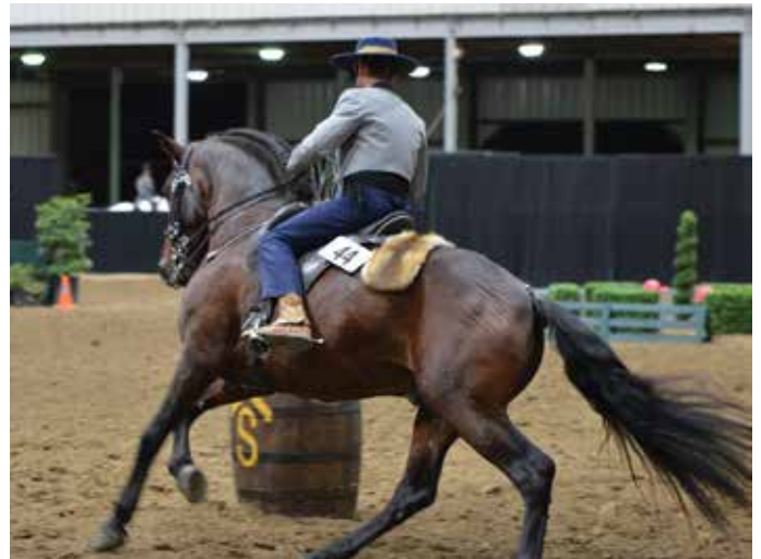
SOUTHWEST CLASSIC WORKING EQUITATION SHOW