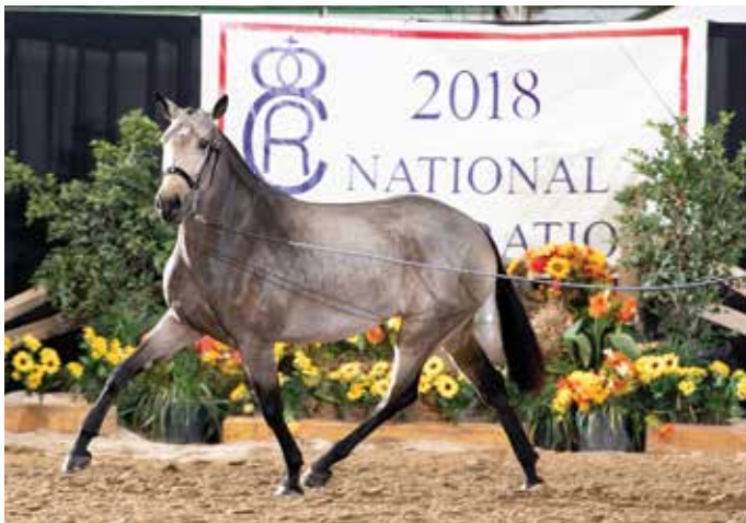
FOUNDATION FOR THE PURE SPANISH HORSE

IALHA was also happy to bring in the Southwest Classic Working Equitation Show, which had 23 horses competing in this exciting sport. The Dressage and Ease of Handling phases were held in one large auxiliary arena, but the Speed phase was held in the Main Arena on Friday night, as a featured event. Exhibitors and management were very happy with the success of its first year, and it appears that they may like to be a part of our show again next year.